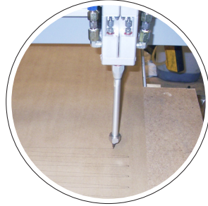
Application by mixing gun