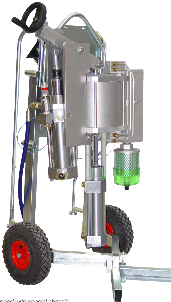
Equipped with special chassis