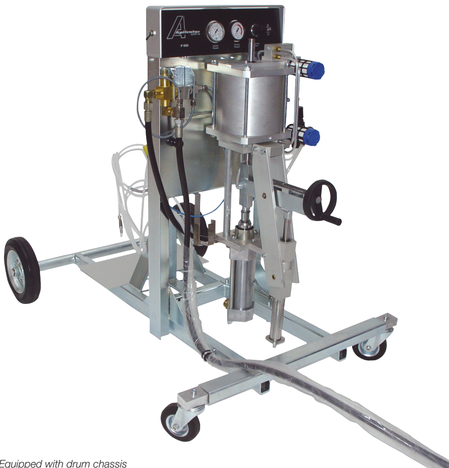
Equipped with drum chassis

– A new designed machine built on the famous IP 8000 series.