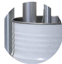
The design of the follower plate makes it possible to use drums with series corrugations/swages/ rolling hoops

A machine specially designed for the application of Polyester or Vinylester based Extrudable bonding paste for CNC-milling or other similar materials in single or multi part form.