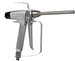
Light weight gun