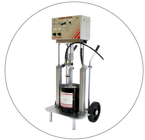
The HVP 200M is a mobile pump with two big wheels and handles for easy movement. The pump is suitable for boat builder's yards, glazing, construction, and vehicle industry.