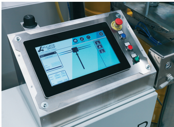
14" Kentima operator panel, touch screen

It's possible to use both 200L drum and/or IBC container for the material handling. The pump and metering system is based on Aplicators renowned Barkvall 3200, a reliable pneumatic driven system which has been on the market for decades. The system has automatic control of material flow and coat weight.