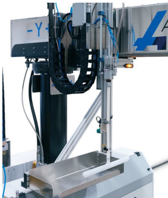
Spreader unit with disposable mixer and spreader

All data and characteristics mentioned in this booklet are by way of example only. Given flow capacities and material pressure are depending of; inlet air pressure, material viscosity, the hose dimensions and other equipment fitted after the pump outlet. Aplicator Group reserves the right to modify the products without prior notice.