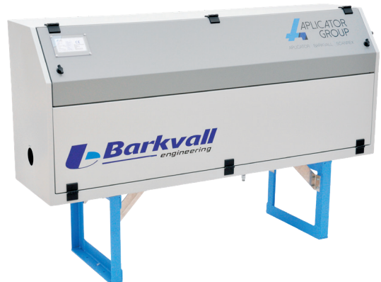
2K metering unit - Barkvall 3200

The machine moves on rails which make it possible to extend the working tables to secure for . Due to the arm with 180° turn function, it's possible to have working tables on both sides of the machine. The arm is rotated with a wireless remote control and the operator can work at the table as the machine moves forward or is operating on the opposite table.