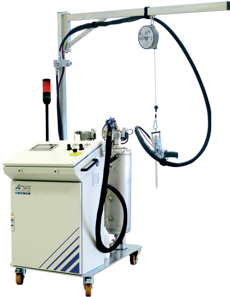
2K GMM E2 equipped with swing arm and balance block