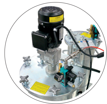
Pressure tank equipped with agitator

The Scanrex 2K GMM E2 is the ultimate solution for precise metering, mixing, and dispensing of two-component materials. This advanced system is designed to handle both low, medium and high viscosity materials such as epoxies, polyurethanes and silicones with