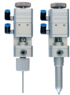
Different nozzles available

The Scanrex 1K GMM is the perfect solution for precise dispensing of high viscosity one component materials such as silicone, epoxy, polyurethane and MS Polymer. The system can be configured to suit a wide range of applications such as CIPG (cured in place gasket),