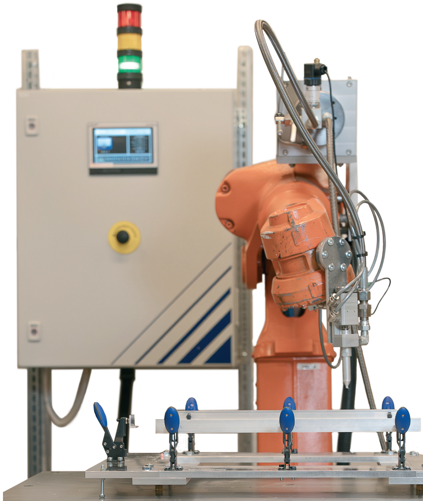
1K GMM adapted for robot application